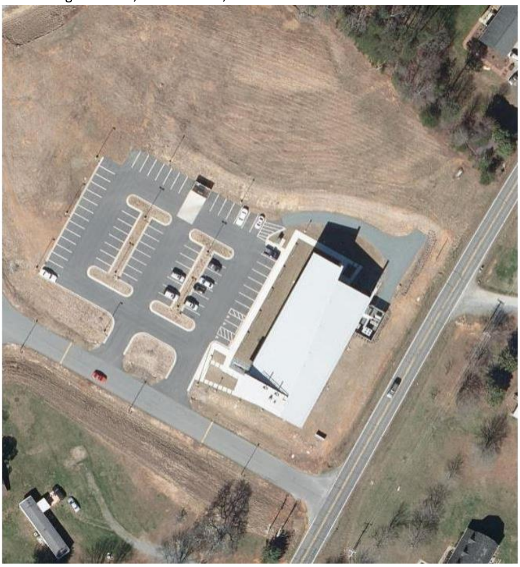
Stokes County Center Geography 1165 Dodgetown Rd, Walnut Cove, NC 27052